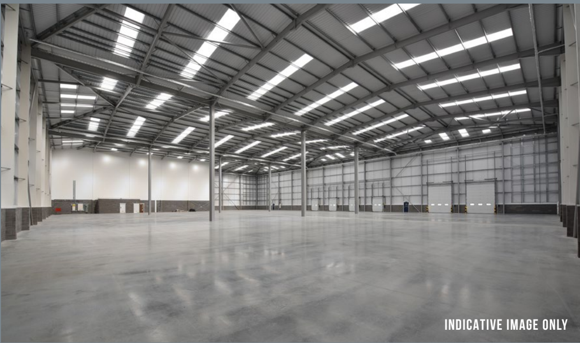
INDICATIVE IMAGE ONLY